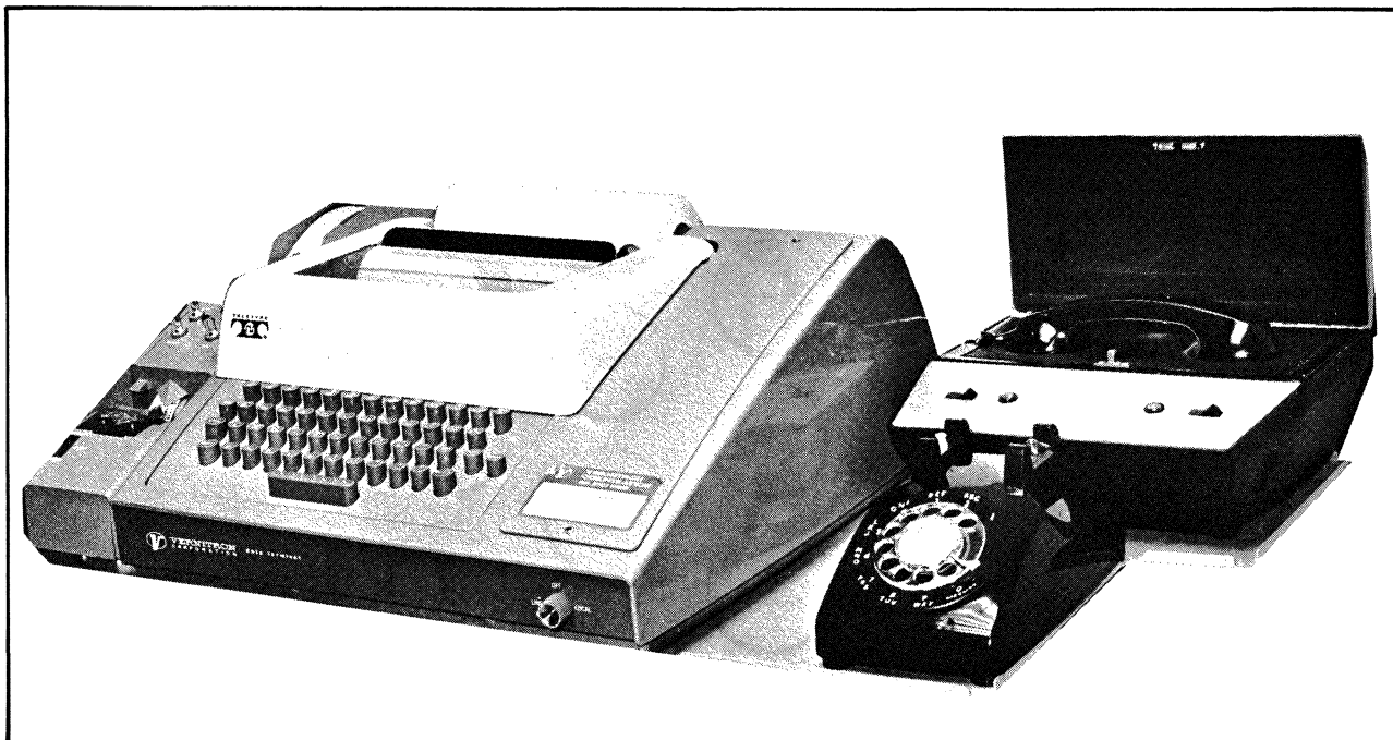
Figure 2. Typical Dialing Unit

Upon receipt of the message LOGON PLEASE:, enter your account, ID, and password, in that order, separated by commas. The password and preceding comma are omitted if no password was assigned.