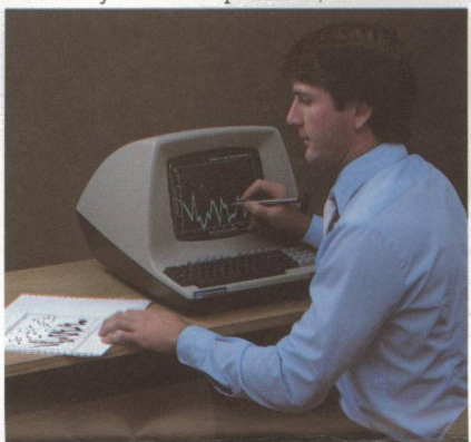
means you are assured of support right from the start. We also offer both factory and distributor-based main-

prehensive 90-day parts and labor warranty on each product, which