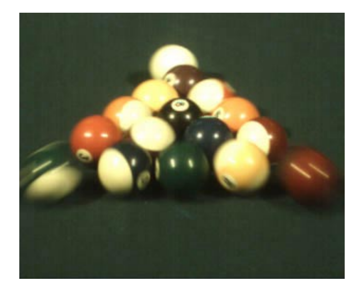
Figure 10: "The Break" shows a pool break at 1/12 real-time. In this frame, the cue ball has just hit the head of the rack

The most interesting application for the Itsy camera is handheld computer vision. To demonstrate this, our colleagues at Compaq's Cambridge Research Laboratory supplied a neural network-based face detector[6] that detects any number of frontal, upright faces in an image. The detector was paired with the Itsy still camera code and the result is a "face finding camera" whose results are shown in Figure 11.