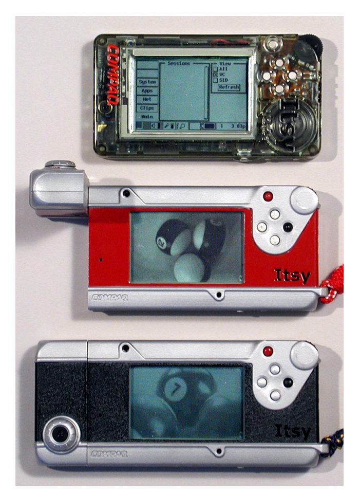
Figure 1: Three Itsy Pocket Computers. At the top of the picture is an unmodified Itsy. It is 118mm x 65mm x 16mm, and weighs (including battery) 130g with a molded plastic case. Below it are two units with the camera extension that are 147mm x 64mm x 20.5mm and weigh (including battery) 195g with a SLA epoxy case, or 267g with a NC tooled aluminum case.

tom of Figure 1. The CMOS imager and lens are contained in a hinged extension to the left end of the case that lengthens it by 29mm. The rest of the electronics are contained on a daughter card that thickens the case by 4.5mm.