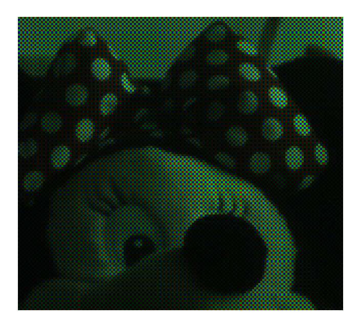
Figure 6: A magnified portion of an image returned by a color PB-0300, where each pixel has only a red, green, or blue value.