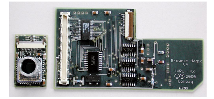
Figure 2: Image sensor and daughter card electronics.

In order to implement this design, the camera's electronics are segmented into two circuit boards as shown in Figure 2. The board on the left contains the CMOS image sensor and the lens. In order to minimize the width of this board, a conventional lens mount that surrounds the image sensor was not used. Instead, an aluminum tube is glued directly to the glass cover of the image sensor and the lens is threaded into it. Opaque plastic tape is applied around the tube to prevent extraneous light from entering the image sensor as shown in Figure 4.