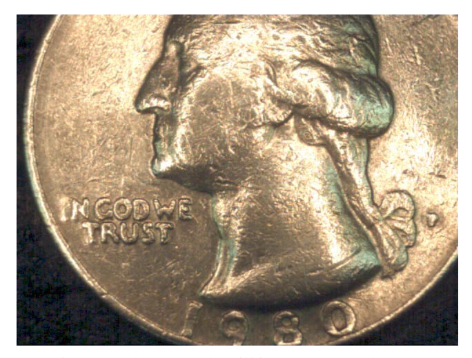
Figure 9: Three sample still images: an outdoor scene, a shop window, and a well-worn quarter.