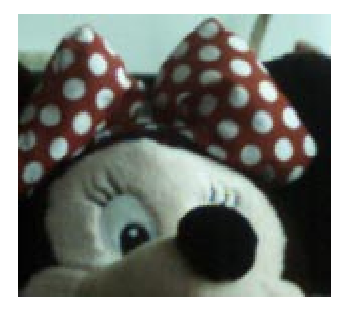
Figure 7: Image color recovery from the image data of Figure 6 using a simple pixel-averaging algorithm.