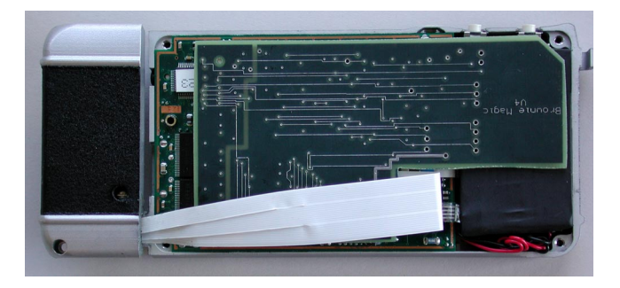
Figure 3: Itsy shown face down with the case back off, the daughter card installed, and cabled to the image sensor card.

The camera is assembled as shown in Figures 3 and 4. In Figure 3, the daughter card is attached to the Itsy motherboard. The daughter card's impact on the thickness of the camera is minimized by careful selection and placement of its components so that they fit in the space available between the daughter card and the motherboard. A thirty-wire 0.5mm flat flex cable connects the daughter card and the image sensor. In order to thread this cable through the hinge, two wires are removed and the cable split as show in Figures 3 and 4.