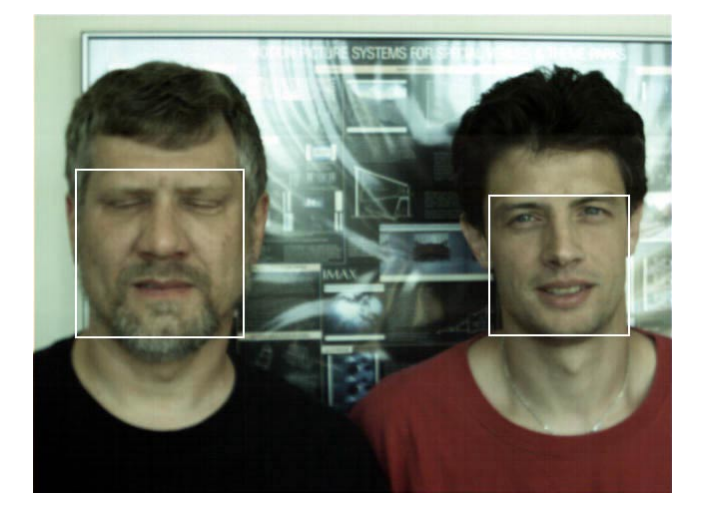
Figure 11: After taking a picture, the "face finding camera" draws a rectangle around each frontal, upright face it finds in the image.

The most interesting application for the Itsy camera is handheld computer vision. To demonstrate this, our colleagues at Compaq's Cambridge Research Laboratory supplied a neural network-based face detector[6] that detects any number of frontal, upright faces in an image. The detector was paired with the Itsy still camera code and the result is a "face finding camera" whose results are shown in Figure 11.