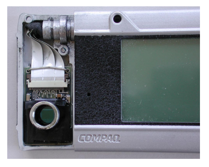
Figure 4: Itsy shown face up with the front of the image sensor case removed.

Even the simplest cameras have moving parts. Here, the lens is rotated in its mount to focus it, and the image sensor/lens arm rotates on a hinge connecting it to the main body of the camera. Based on experience with other cameras and electronics, users have an expectation about how things should move: freely without overshoot, yet hold their position when stopped. This is accomplished by lubricating the joint with the appropriate grade of damping