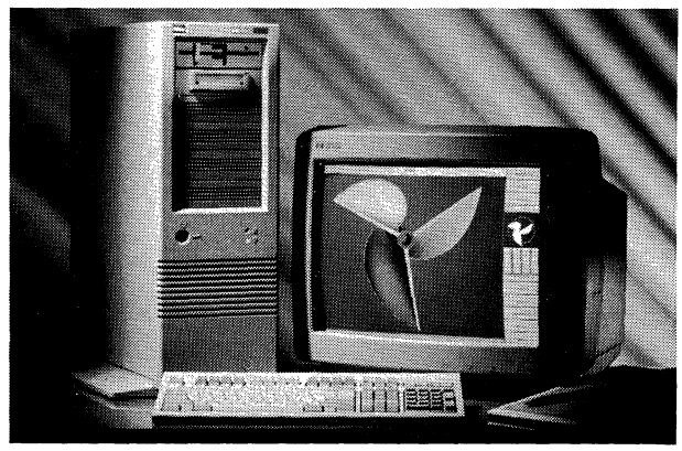
The HP Vectra 486 PC is expected to find wide use as a file server in network applications. Based on the Intel i486 microprocessor, the machine is Hewlett-Packard's first use of the 32-bit EISA bus architecture.

In November 1989, HP announced the long-awaited NewWave Office system. The release of NewWave Office was held back pending the outcome of the Apple vs. Microsoft and Hewlett-Packard lawsuit. Apple charged that Microsoft Windows and NewWave Office resembled the Macintosh user interface closely enough to violate Apple's copyright. While the issue is still in litigation,