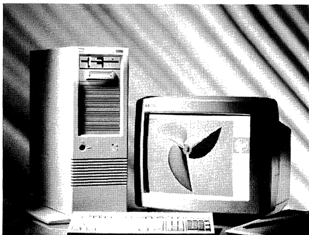
The HP Vectra 486 PC is the first of Hewlett-Packard Company's new generation of PCs based on the Intel i486 microprocessor and the extended industry standard architecture (EISA).